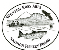
WRASFB - Wester Ross Area Salmon Fishery Board