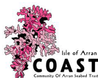
Community of Arran Seabed Trust (COAST)