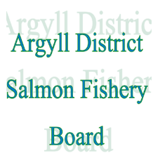
Argyll District Salmon Fishery Board