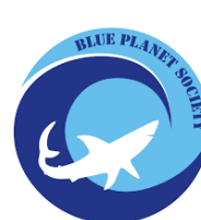
Blue Planet Society