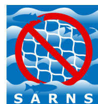
Salmon Aquaculture Reform Network Scotland