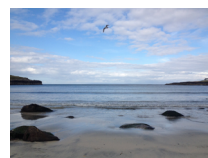
Skye Communities for Natural Heritage